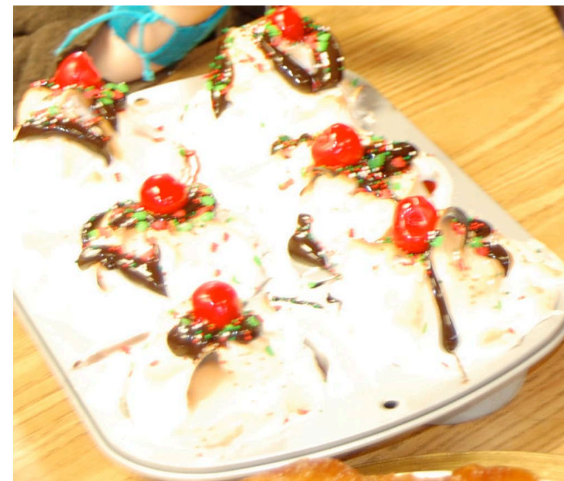
Baked Snow Balls Rating: 1 2 3 4 5

Ingredients: 12 vanilla cookies or six 1/2-inch-thick slices of your favorite cake 6 scoops of vanilla ice cream 3 egg whites at room temperature 1/4 teaspoon cream of tartar 1/4 cup sugar 1/2 teaspoon vanilla extract Chocolate syrup, sprinkles, and Maraschino cherries 1. Break each cookie into several small pieces and divide them evenly among six 3-inch cups, pressing them into the bottom of each. Fill each cup with ice cream, using the back of a spoon to smooth it level at the top. Place the cups on a cookie sheet in the freezer while you prepare the meringue. 2. Heat the oven to 500°. Place the egg whites in a medium-size bowl and whip them with an electric beater set at medium-high speed until they look like soap bubbles. Add the cream of tartar and continue beating until soft peaks form (now it will look like whipped cream). While you continue beating, add the sugar 1 tablespoon at a time and then the vanilla extract. Continue beating until shiny, stiff peaks form, about 2 minutes. 3. Remove the cups from the freezer and spread the meringue over the top of each with a spatula, making sure to completely cover the ice cream. This meringue is what insulates the ice cream, keeping it cold in the hot oven. Bake the snowballs on the cookie sheet until the tops are golden brown, about 1 to 3 minutes. Watch them carefully. They brown quickly. Add the chocolate syrup, sprinkles and cherries. It serves 6.