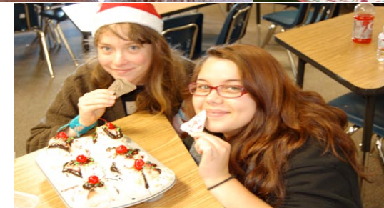
Peppermint Bark Rating: 1 2 3 4 5

Ingredients: 12 vanilla cookies or six 1/2-inch-thick slices of your favorite cake 6 scoops of vanilla ice cream 3 egg whites at room temperature 1/4 teaspoon cream of tartar 1/4 cup sugar 1/2 teaspoon vanilla extract Chocolate syrup, sprinkles, and Maraschino cherries 1. Break each cookie into several small pieces and divide them evenly among six 3-inch cups, pressing them into the bottom of each. Fill each cup with ice cream, using the back of a spoon to smooth it level at the top. Place the cups on a cookie sheet in the freezer while you prepare the meringue. 2. Heat the oven to 500°. Place the egg whites in a medium-size bowl and whip them with an electric beater set at medium-high speed until they look like soap bubbles. Add the cream of tartar and continue beating until soft peaks form (now it will look like whipped cream). While you continue beating, add the sugar 1 tablespoon at a time and then the vanilla extract. Continue beating until shiny, stiff peaks form, about 2 minutes. 3. Remove the cups from the freezer and spread the meringue over the top of each with a spatula, making sure to completely cover the ice cream. This meringue is what insulates the ice cream, keeping it cold in the hot oven. Bake the snowballs on the cookie sheet until the tops are golden brown, about 1 to 3 minutes. Watch them carefully. They brown quickly. Add the chocolate syrup, sprinkles and cherries. It serves 6.