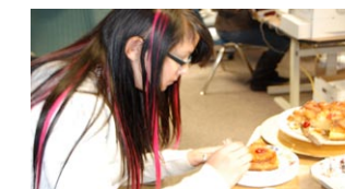
Pineapple Upside-down cake Rating: 1 2 3 4 5

1 cup milk chocolate 1 cup white chocolate Peppermint candy canes 1. Melt the chocolate over a double boiler until smooth. Spread in an even layer on a wax paper-lined baking sheet. Place in freezer to harden, approximately 30 minutes. 2. Melt the white chocolate over a double boiler until smooth. Pour on top of the dark chocolate layer. Working quickly before the white chocolate sets, sprinkle the crushed candy canes on top and gently press into the chocolate. Refrigerate until complete hard and set, at least 2 hours.