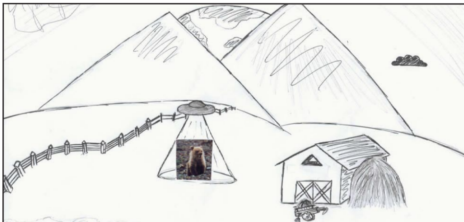
A typical scene of an alien abduction.

I have no idea if this is really a rumor, if it's true or not, but I honestly don't even feel right calling it a rumor.